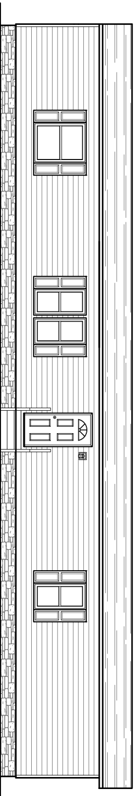
FRONT SIDE ELEVATION